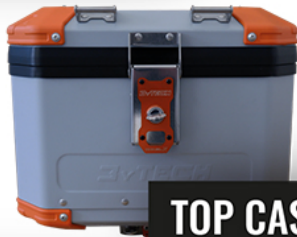
TOP CASE MODEL-X